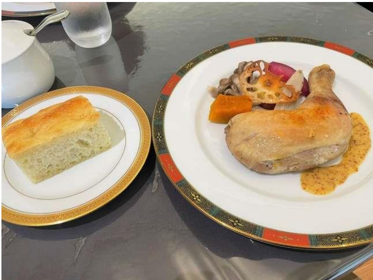
Menu: Chicken confit with focaccia set

> ⌚ 13:40~ Matcha tasting experience at "Korin-yashiki" in MOA Museum of Art