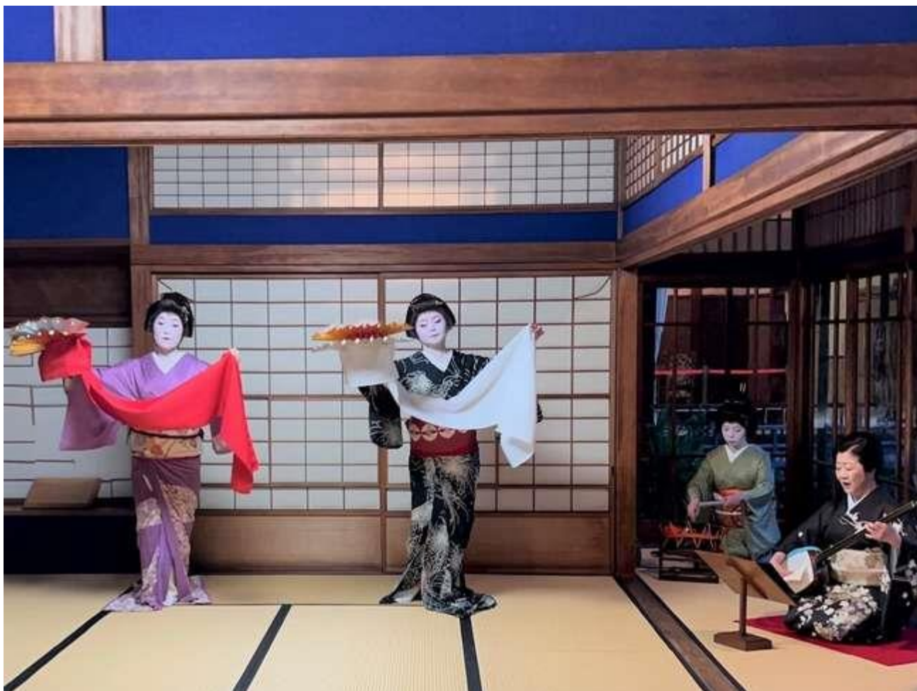
Atami geisha performance at Kiun-kaku