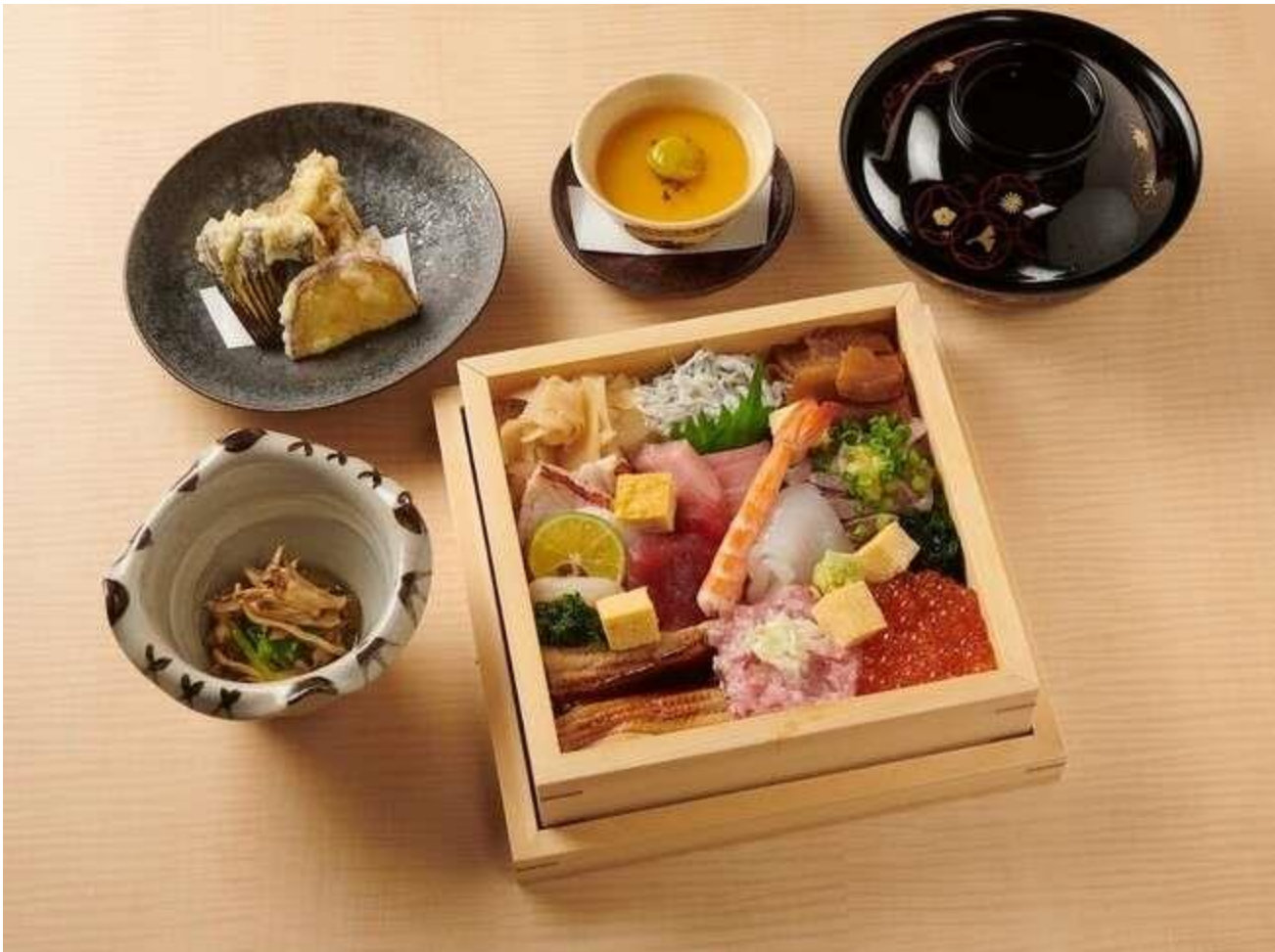
Seafood bowl (with small side dish and soup)

Enjoy a seafood bowl at "Sushi Kappo Umi no Yuha" in Fufu Atami Konoma no Tsuki.