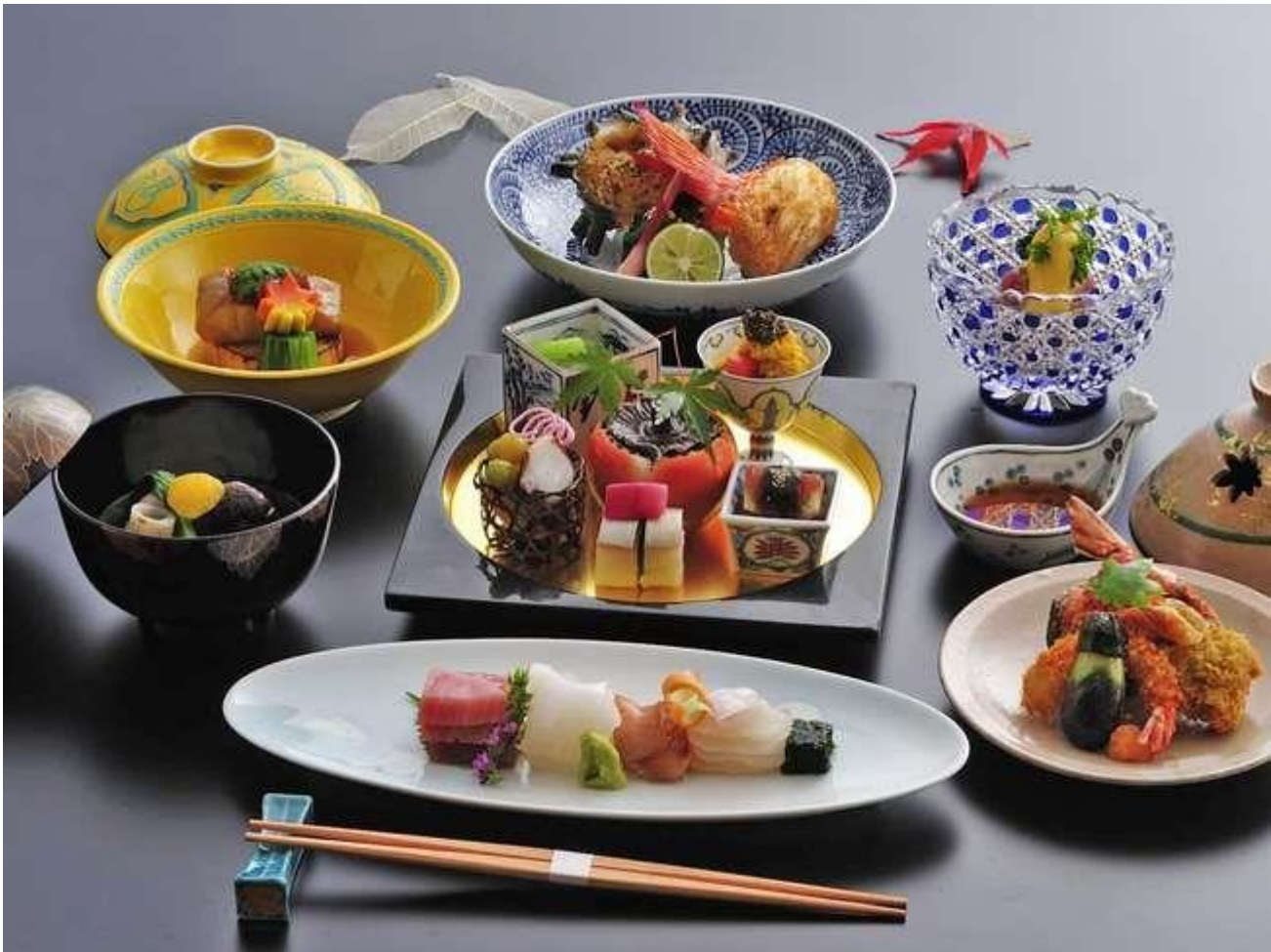
Ryotei Ryokan Atami Koarashi cuisine (Image)