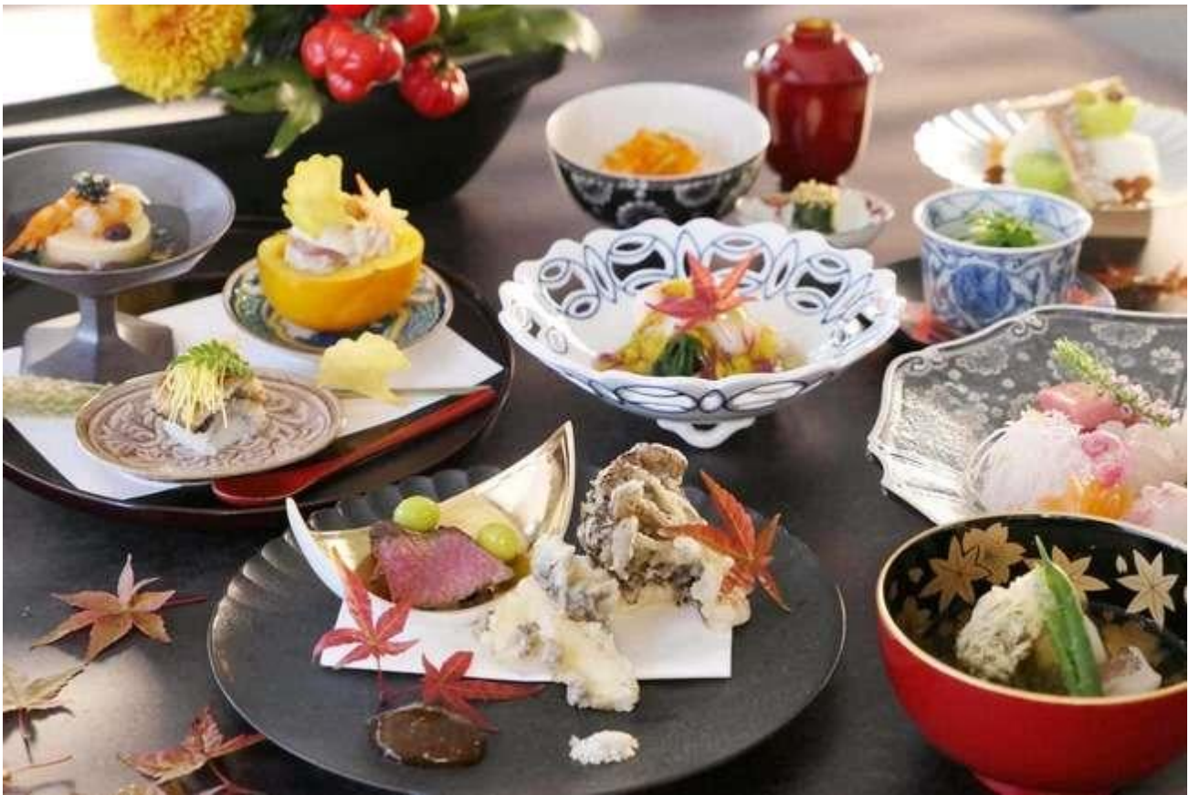
Atami Pearl Star Hotel cuisine (Image)