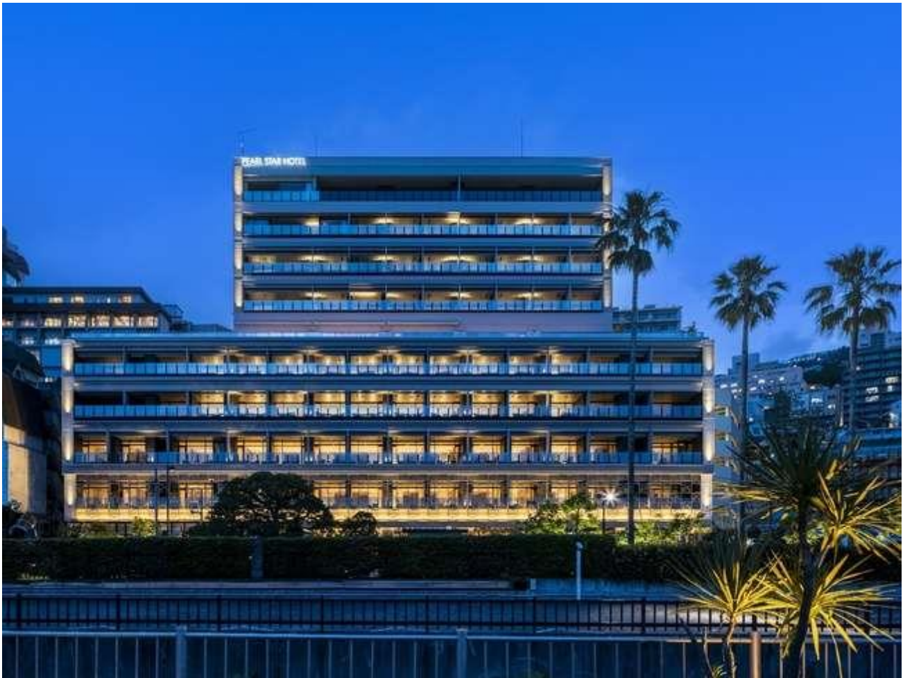
Atami Pearl Star Hotel (Exterior)