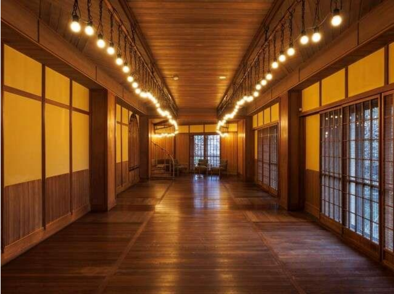
Former Hyuga villa underground space

It consists of three rooms: a social room using bamboo and paulownia, a Western-style room with integrated stairs, and a Japanese-style room, all designed with Japanese aesthetic principles like those found in Katsura Imperial Villa.