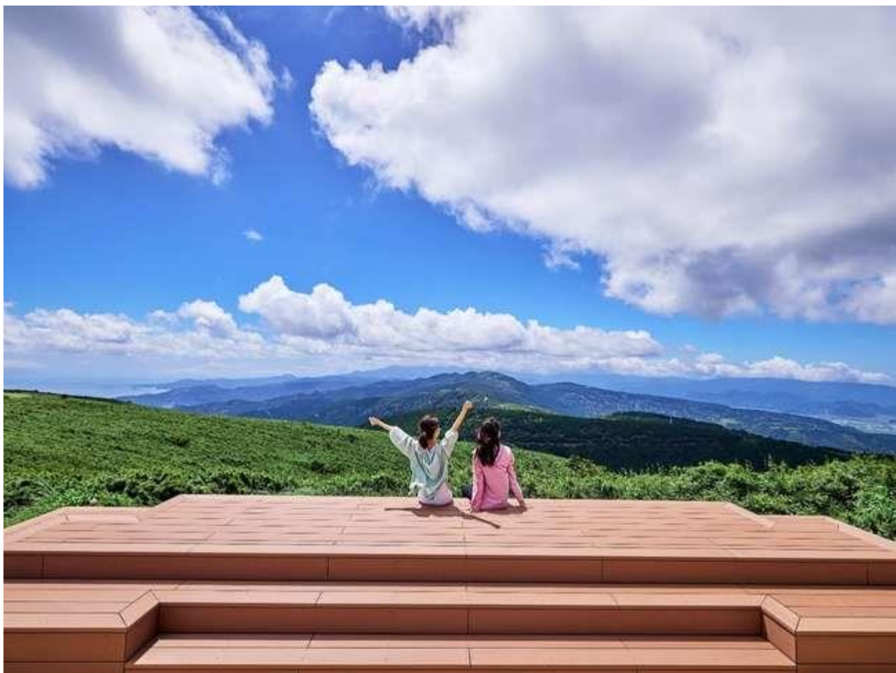
Jukkoku Pass Observation Deck

> 🕒 17:00~ Exclusive experience at Kiun-kaku