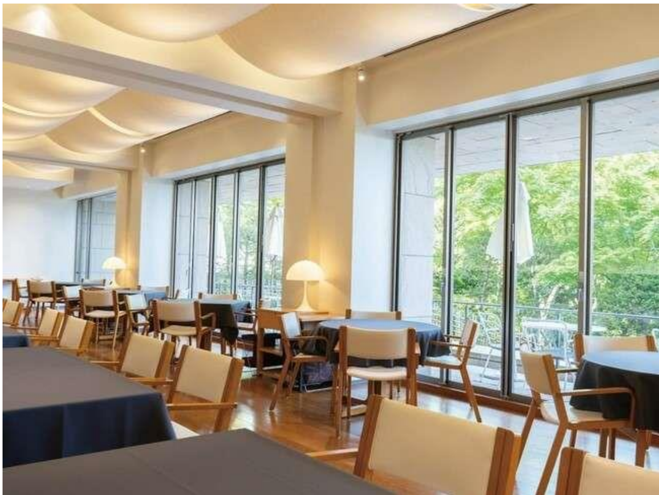
Restaurant "La Pâtisserie du musée par Toshi Yoroizuka"