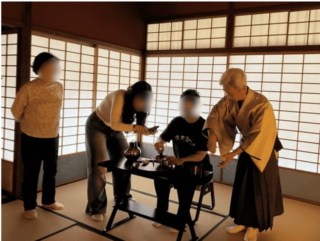
Matcha experience at Korin-yashiki

> 🕒 14:30~ Guided tour of MOA Museum of Art by a specialist