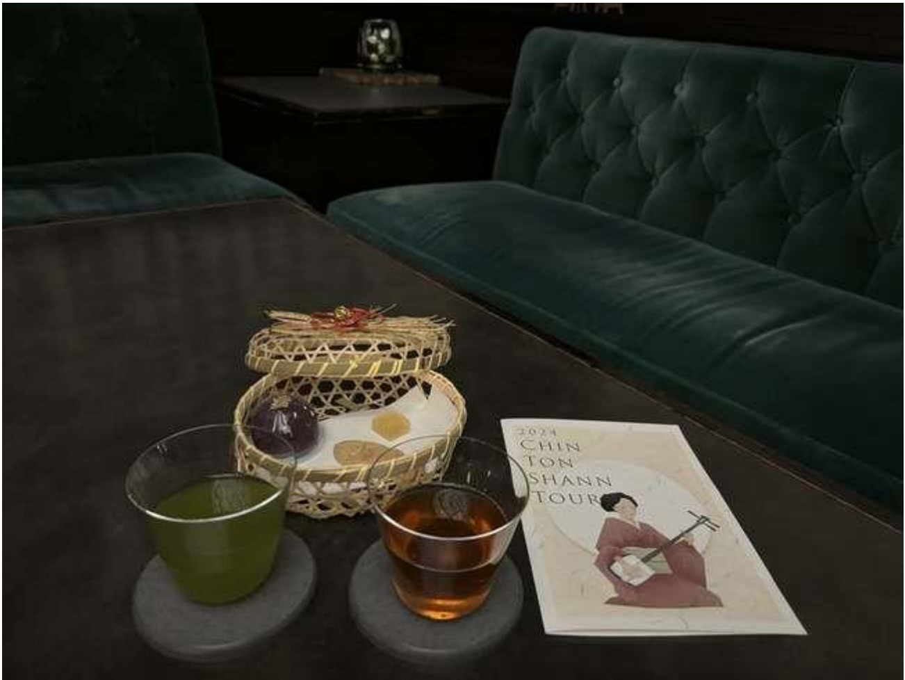
Sweets at "Cafe Yasuragi" (Image)