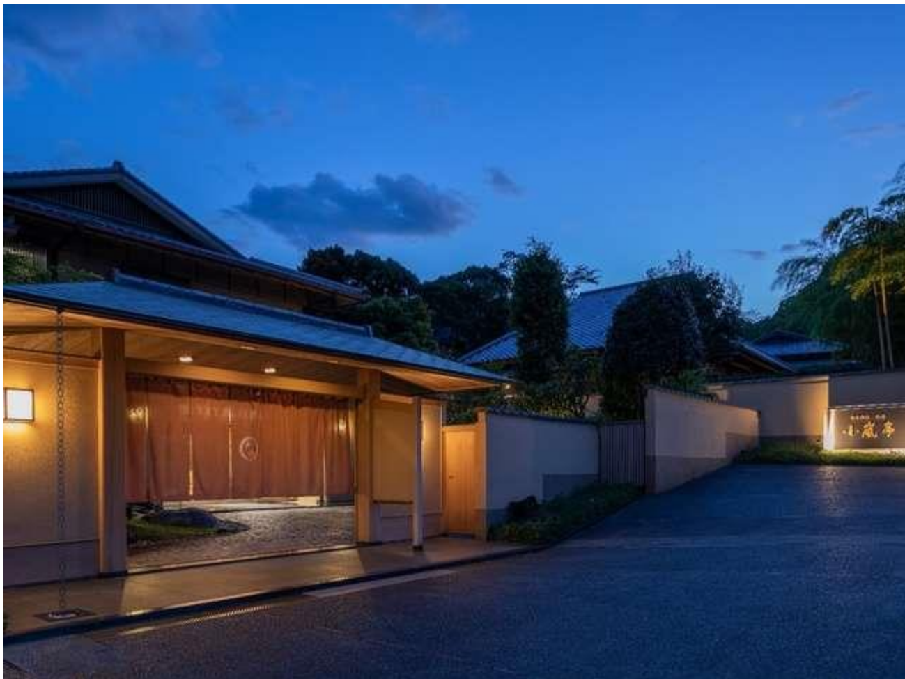
Ryotei Ryokan Atami Koarashi(Exterior)