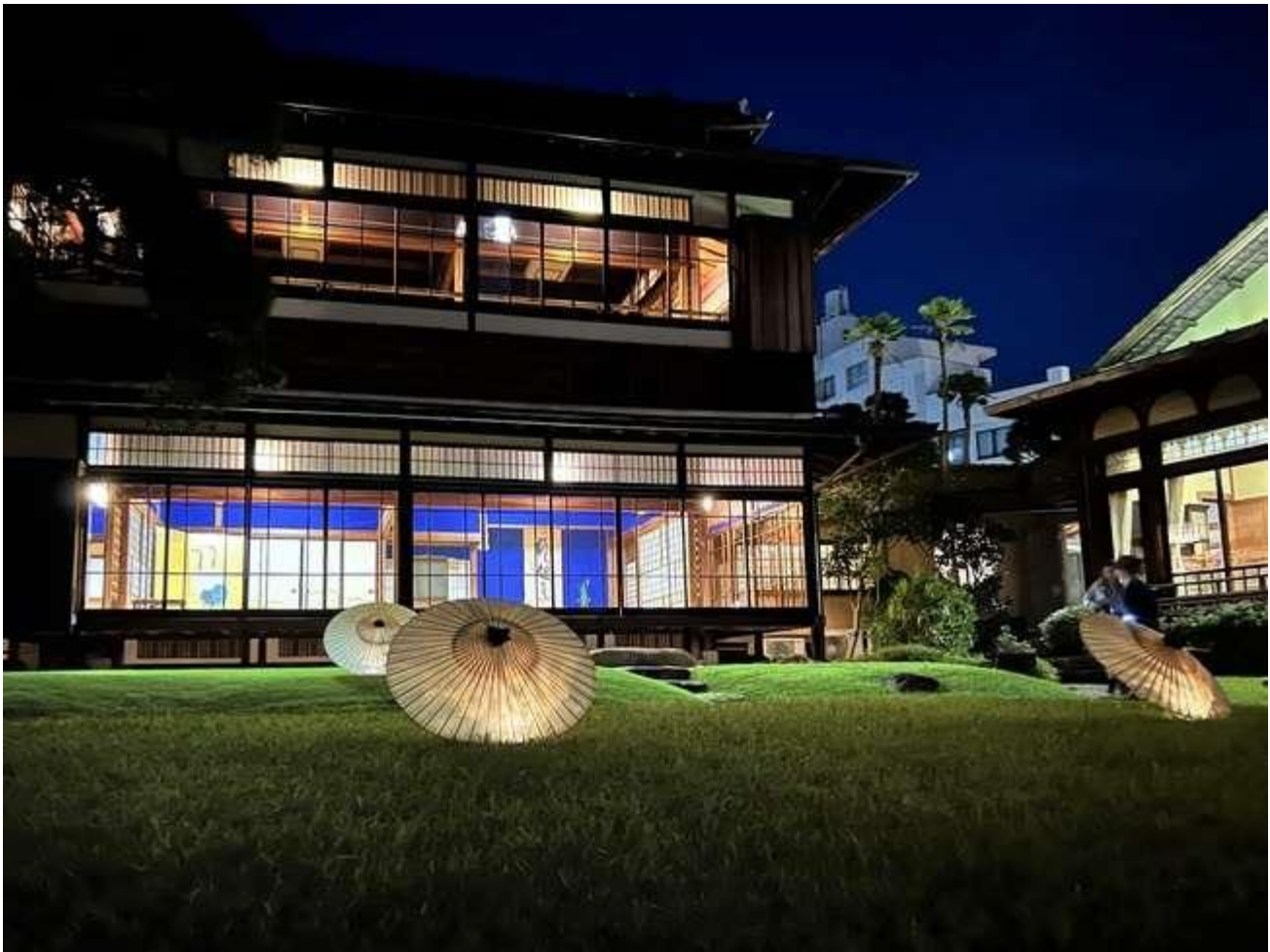
Kiun-kaku night illumination