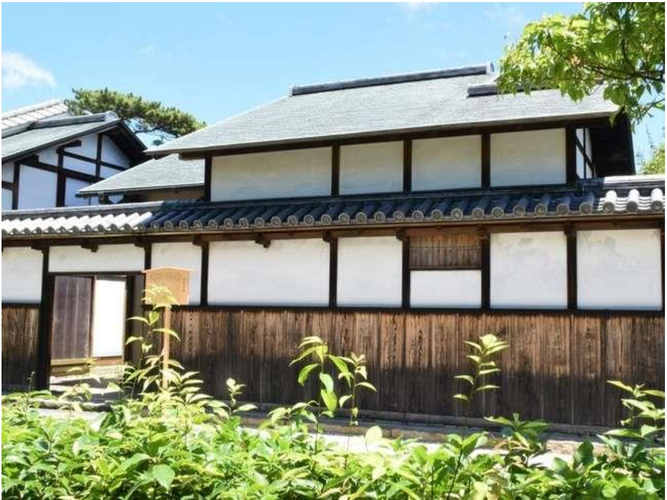
Korin Residence (Appearance)