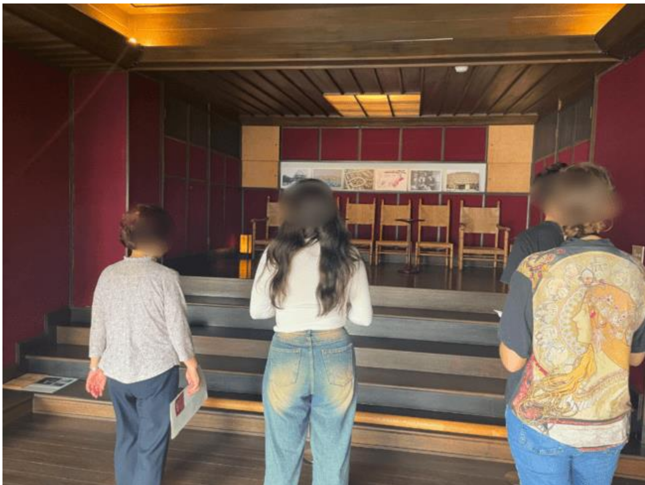
Former Hyuga villa tour

> ⌚ 10:35~ Single flower arrangement experience at Tozan-so, a nationally registered tangible cultural property